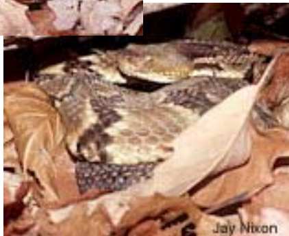
Timber Rattlesnake (light)

Northern Copperhead- Venomous- A stout bodied snake found in rural and rocky areas in most of Maryland. It is rather secretive and usually not encountered. Very triangular shaped head, broad coppery brown hour-glass bands across a light beige background on the back. Bears live young.