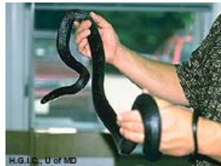
Black Rat Snake

well away from water. Amphibians differ greatly from reptiles in reproduction. Amphibians, in general, lay soft, gelatinous eggs directly in water or other very wet places. The eggs hatch into larvae such as tadpoles with gills and later change into adults with lungs and legs.