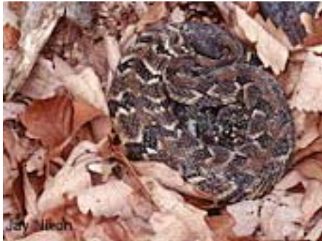
Timber Rattlesnake (dark)

Timber Rattlesnake- Venomous- A stout bodied snake found predominately in western Maryland but may be encountered in other regions. Has a large chunky and triangular shaped head, dark pattern over a greenish brown background. Rattle on the tail. Bears live young. Rare in most areas.