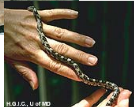
Juvenile Black Rat Snake

Corn or Red Rat Snake-Harmless. A relative of the Black Rat snake, it is usually brilliantly colored with large orange blotches bordered with black down the back. Its background color is tan to gray. Not as common as the black rat snake; found in rural areas. Lays eggs.