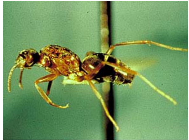
Odorous House Ant (EPA)

Adult winged males and females emerge from their cocoons and eventually leave the nests. Emergence of large numbers of ants (swarming) usually occurs at certain times, and often this is the only time we notice the ants at all. Males seek out females in the swarm; mating usually occurs in the air. Males die soon after the mating flight, while the female seeks out a crevice or similar hiding place. She then removes her wings, forms a small cell, and lays a few eggs. The eggs hatch into tiny, white, legless grubs. The queen feeds these grubs, or larvae, with a nutritious fluid that forms in her digestive system. When the grubs are fully-grown, they change into a nonfeeding pupal stage from which emerge the common "worker" ants. These workers begin to forage for food, some of which is fed to the queen and some to the new larvae from the next lot of eggs. Adult workers may live for weeks,