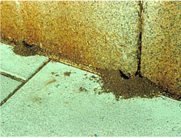
Pavement ant mounds

small house ants. Traps will take from 24 to 48 hours to work, so be patient. If used correctly, most ants will be controlled without having to apply any insecticides in the home.